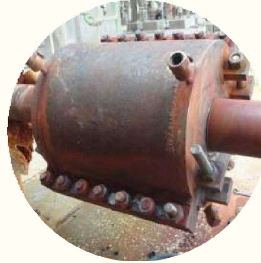
On-line Leak Sealing